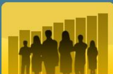
Online Focus Groups